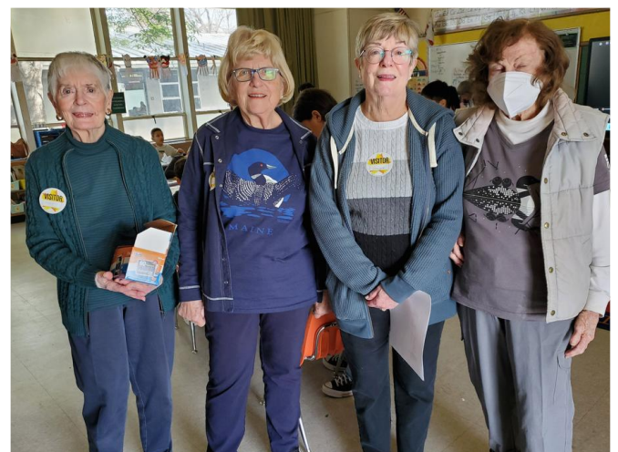
SAM volunteers at Fair Oaks Elementary